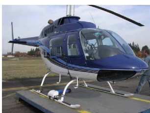
Bell 206 / 212 / 222 / 412