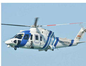
S-76A / AS350