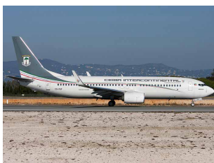
Boeing 737 NG