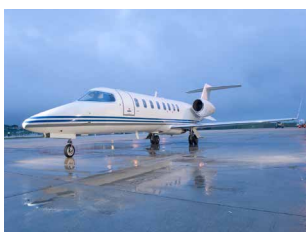
Learjet 40 / 45