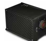
Attitude Heading Reference System