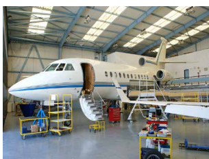
Falcon 50 / 900