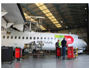
ATR 42 / 72