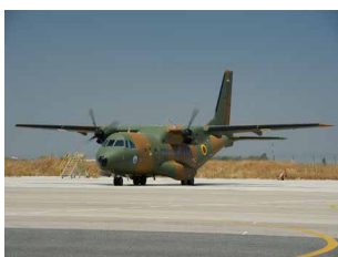
C-212 / CN-235 / C-295