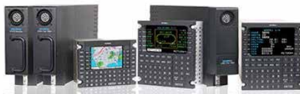
SBAS - FMS Family