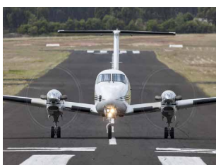
Beech 200 / 1900