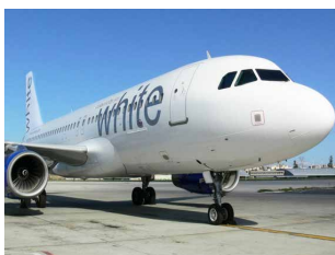
Airbus A320 Family